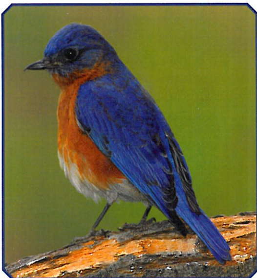
Eastern Blue Bird