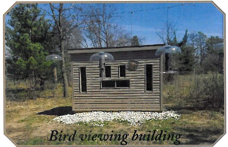
Bird viewing building