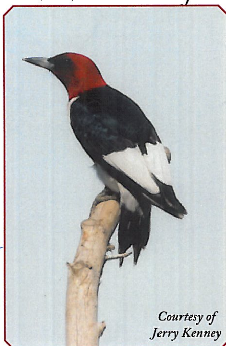
Red Headed Woodpecker